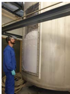
Figure 2: Tank filling with a sporicidal stable foam (20m 3 )

The humidity of the foam was homogeneous up to 4 meters high and foam stability was more than one hour. Moreover, this foam was sprayed on different walls to verify the adhesion on different substrates. This foam adheres to vertical wall.