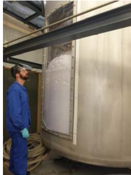
Figure 2: Tank filling with a sporicidal stable foam (20m 3 )

The humidity of the foam was homogeneous up to 4 meters high and foam stability was more than one hour. Moreover, this foam was sprayed on different walls to verify the adhesion on different substrates. This foam adheres to vertical wall.