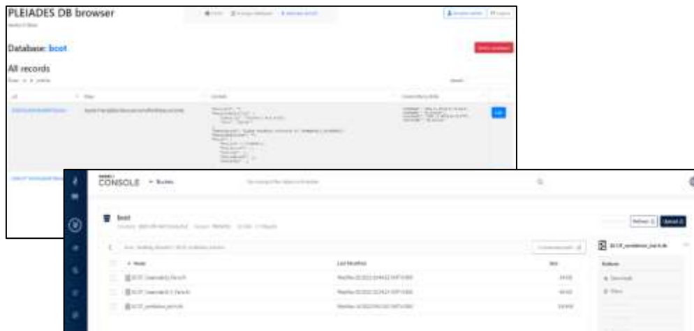
FIG. 3. Images of database and file storage browsers

All this data is hosted in platform databases, one per use case. The files, such as 3D models, are hosted in the file storage server.