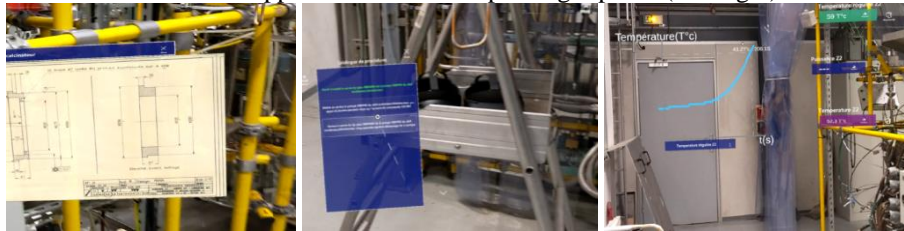
Fig.5. Example of user rendering: 2D plan (left) procedure (middle) and sensor graph (right)

The next step in the project was to build on the visual DT developed earlier, by filling in all the metadata linked to the process, such as references, builder data, material, mass... linked to the objects, as well as drawings, assembly or maintenance procedures. A digital database has been built to match the objects with the metadata. All this data can be accessed via the application with a simple finger pinch (see Fig.5).