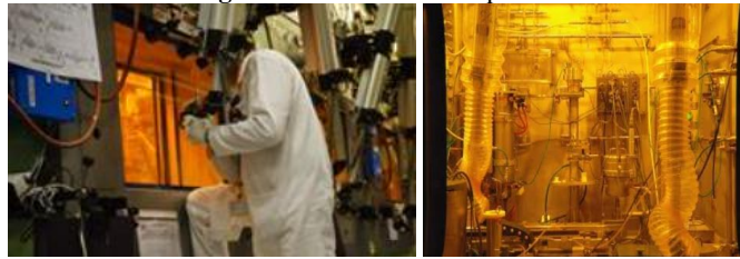
Fig. 2. VESPA vitrification process located in the shielded cell

The SOSIE project aims at developing on the two case studies identified: