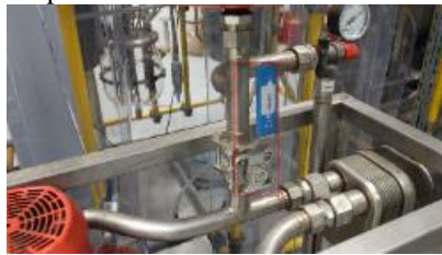
Fig. 7. Object and key point detection of valves using YOLO

The SOSIE project also implements pre-trained computer vision algorithms, such as YOLO (You Only Look Once) [15], for efficient and accurate object detection within complex industrial workflows. Leveraging the principles of transfer learning, YOLO is adapted to the specific object detection requirements of industrial environments by fine-tuning it on a dataset tailored to the objects of interest. This approach capitalizes on the knowledge encoded within the pre-trained YOLO model, enhancing its ability to detect objects relevant to industrial processes.