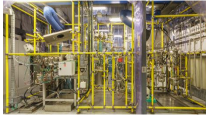
Fig. 1. ELVIS vitrification process

The objective therefore consists of implementing all these digital technologies on two case studies in Marcoule (Bagnols sur Cèze, France), two complementary vitrification processes: the first is a cold process (without radioactivity), called ELVIS (see Fig. 1), and the second, called VESPA (see Fig. 2), is a production process implemented in a shielded cell.