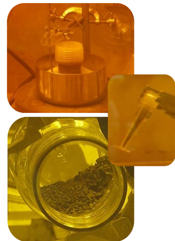
Figure 1: Illustration of the different phases of the study

The plutonium concentrations calculated using the theoretical model on solid samples were compared to the concentrations obtained after dissolution: discrepancies of less than 30% were obtained (the lower limit was estimated at 0.3 \text{ mg.g}^{-1} of Pu).