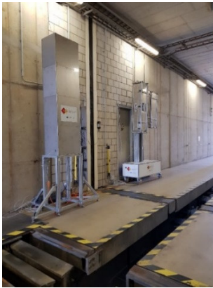
Fig. 1. One side of the photofission system in the X-ray tunnel.

After more than two years of experimental tests using a Linatron-M9 linac at the SAPHIR facility (CEA Saclay, France) [3] and optimizing the subsystems, the photofission system has been deployed in September and October 2018 at Maasvlakte — the largest seaport in Europe — which is located in the suburbs of Rotterdam, Netherlands. Fig. 1 and fig. 2 show one side of the photofission system in the X-ray tunnel where cargo containers are transported by truck.