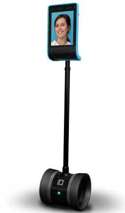
Fig. 2. Double3 robot