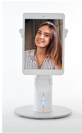
Fig. 1. Kubi robot