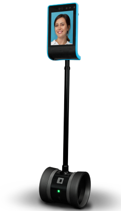
Fig. 2. Double3 robot