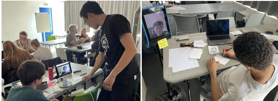
Fig. 3. Experimental scenarios with Kubi robot (left) and Double robot (right)

Each class session lasted three hours, during which the students collaborated in groups. During all the sessions, the teacher gave a brief introduction before visiting each group to assess their progress and offer guidance. In one group, only one student interacted with the Kubi robot, while the other attendees were physically present. In a different group, a single student engaged with the Double robot, while the remaining participants joined in person (see Figure 3). After each session, participants completed two questionnaires.