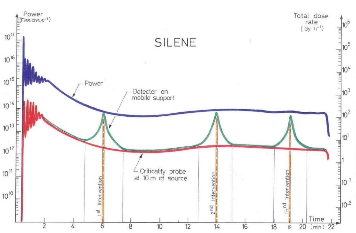
Figure 3 – Dose-rates measurements of the “intervention simulation” SILENE experiment

The processing of the dosimetric devices placed on the cart then allowed obtaining an estimate of the integrated dose, as well as the neutron and gamma dose-rates, during the post-accidental phase. An example of experimental results is presented in figure 3 below. Corresponding numerical values are presented in table II.