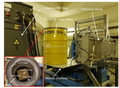
Fig. 2. View of the experimental setup at the SAPHIR platform including a 220-liter concrete-lined mock-up drum [3].

Active LINAC measurements are carried out with both readout electronics at the SAPHIR platform with a detection block made of five <sup>3</sup>He 150NH100 proportional counters in a polyethylene matrix and cadmium casing. The sample is positioned 1.5 m away from the LINAC target and placed inside a concrete-lined waste drum, as can be seen in Fig. 2. The LINAC is operated at 100 Hz and 9 MeV energy during 5 min-irradiations.