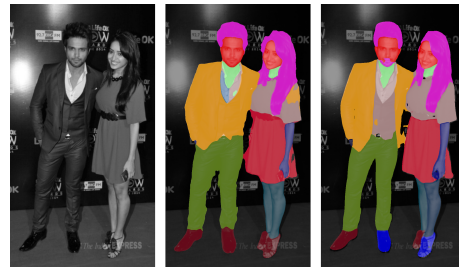
Fig. 1: Human Attribute Segmentation (HAS) of a sample (left) from unlabeled target dataset MHP-GB [2] by HRDA [3] (middle) and UDA-HPTR (right).

Human Attribute Segmentation (HAS) is a specific semantic segmentation task that localizes pixelwise the human attributes (visible body parts, clothes and accessories) in an image (cf. Fig. 1). This fine-grained description of people is generally handled together with the person detection and