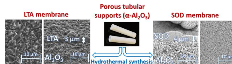
Figure 1. SEM micrographs of LTA and SOD zeolite membranes deposited on the inside of tubular alumina supports.

synthesis trials have demonstrated the difficulty of creating a homogeneous membrane in a single hydrothermal synthesis. The density of the zeolite deposit was increased through the implementation of protocol with two successive hydrothermal syntheses.