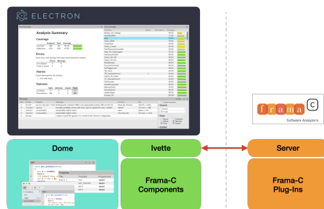
Fig. 2. Technical Organization of Ivette