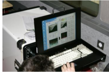
Fig. 3: Optoelectronic MWS

Such optoelectronic acts as a "Master Wavelength Server" (MWS) sending wavelengths data over an Ethernet link to a "supervision client" computing force, position and temperature parameters, and displaying them in real-time onto the screen (Fig. 4). Simultaneously, this "Supervision Client" provides 0-10 V analog outputs to the end-user reference system.