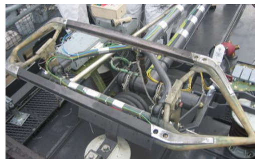
Fig. 2 Smart TGV pantograph