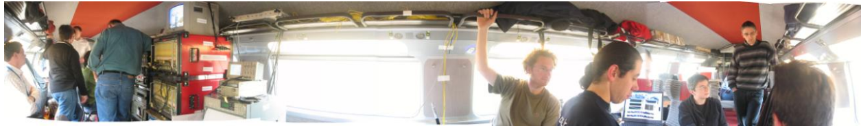
Fig. 5: 180° view of measurement systems during tests at 320 km/h

On-line validation tests were performed on more than 6000 km during 5 full days on a very high speed train "TGV Duplex" between Paris and Vendôme (France) at speeds up to 320 km/h (Fig. 5). Contact forces between the pantograph and the OCL, as well as temperatures inside the current collectors were computed in real time at 500 Hz, on 4 optical lines in parallel. During these TGV tests, the innovative FBG measurement system developed by the CEA LIST has demonstrated its reliability and accuracy with pantohead temperature measurements (up to 160°C), and coherence with contact force measurements in comparison with SNCF reference records.