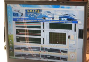
Fig. 4: Supervision Client screen with real time display of requested parameters.