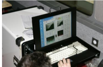
Fig. 3: Optoelectronic MWS

Such optoelectronic acts as a "Master Wavelength Server" (MWS) sending wavelengths data over an Ethernet link to a "supervision client" computing force, position and temperature parameters, and displaying them in real-time onto the screen (Fig. 4). Simultaneously, this "Supervision Client" provides 0-10 V analog outputs to the end-user reference system.