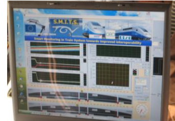
Fig. 4: Supervision Client screen with real time display of requested parameters.