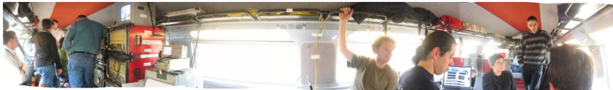
Fig. 5: 180° view of measurement systems during tests at 320 km/h

On-line validation tests were performed on more than 6000 km during 5 full days on a very high speed train "TGV Duplex" between Paris and Vendôme (France) at speeds up to 320 km/h (Fig. 5). Contact forces between the pantograph and the OCL, as well as temperatures inside the current collectors were computed in real time at 500 Hz, on 4 optical lines in parallel. During these TGV tests, the innovative FBG measurement system developed by the CEA LIST has demonstrated its reliability and accuracy with pantohead temperature measurements (up to 160°C), and coherence with contact force measurements in comparison with SNCF reference records.