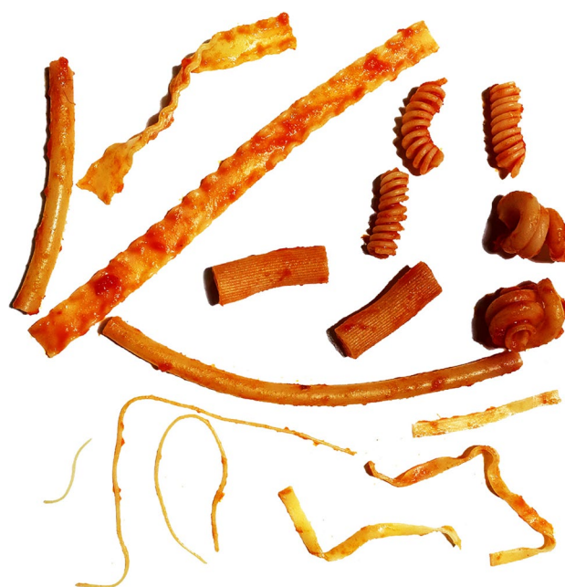
Fig. 3 Parallel between the form of pasta and the alpha-synuclein assemblies involved in MSA and PD. Pastas exhibit different shapes as fibrillar alpha-synuclein polymorphs do. Some are thick, some are thin, some are twisted, and some are flat. The different shapes pastas exhibit define how they interact with their environment, here, the tomato sauce. Some interact very efficiently with the sauce with high binding; they look dark, others much less efficiently and look pale

Competing Interests The author declares no competing interests.