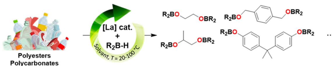
Figure 2. Our catalytic system for the reductive depolymerization of polyesters and polycarbonates

Inspired by the work of T. J. Marks et al. , [5] on the reduction of esters, we considered the trisamide complex La[N(SiMe_3)_2]_3 as a 4f-catalyst and the pinacolborane as a hydride donor, for the reductive depolymerization of a wide range of polyesters and polycarbonates.[6]