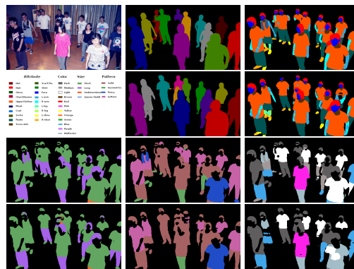
Fig. 1: Example of CCIHP ground truths (1st and 3rd rows) and our model predictions (2nd and 4th rows). First two rows: RGB image and legends, human instance, and semantic attribute maps. Last two rows: size, pattern and color maps.

Unlike attribute classification that aims to predict multiple tags to the image of a person [2] (sometimes deceived by nearby people/elements), human parsing (HP) [3, 4, 5, 6] aims to segment visible body parts, clothing and accessories at the pixel level. Localizing semantic attributes has several advantages. It provides a precise delineation of attributes