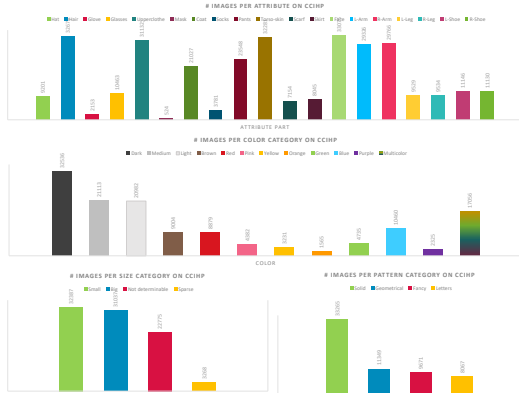
Fig. 2: Image distribution on the 19 (resp. 12, 4, 4) semantic attribute (resp. color, size, pattern) labels in CCIHP.

Human instances 110,821 people (+121 humans compared to CIHP [6]) are annotated with full masks including accessories that did not have labels in the semantic attributes. Thus,