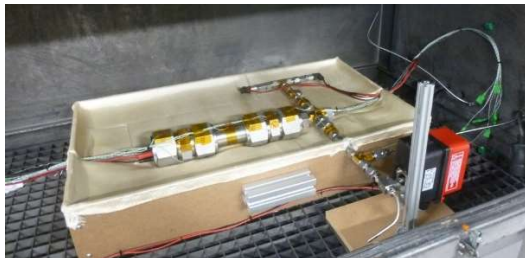
Fig 2 - Closed vessel equipped with pressure and thermal sensors

A closed pressure vessel calorimeter is used, allowing the evaluation of thermal runaway energy release as well as pressure evolution and gases composition. The thermal runaway of Li-ion cells is forced by a controlled temperature rise (6°C/min as defined in DO311A). The cell temperature, calorimeter temperature and pressure build-up evolutions are recorded during and after runaway. This allow evaluating precisely thermal runaway temperature threshold, gas volume exhausted and thermal runaway energy. This kind of test gives important data for modelisation activities detailed previously [ref 2].