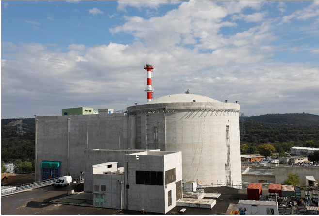
Fig. 1. Jules Horowitz Reactor – October 2017.

The construction is made within the framework of an international consortium: CEA, EdF, AREVA SA, Framatome, Technicatome (France); European Commission with JRC as Observers; CIEMAT (Spain); SCK-CEN (Belgium); VTT (Finland); UJV (Czech Republic); Studsvik AB (Sweden); NNL (UK); DAE (India); IAEC (Israel). Some contacts are ongoing with other foreign entities to discuss their potential interest to join the consortium, or to participate in future programmes.