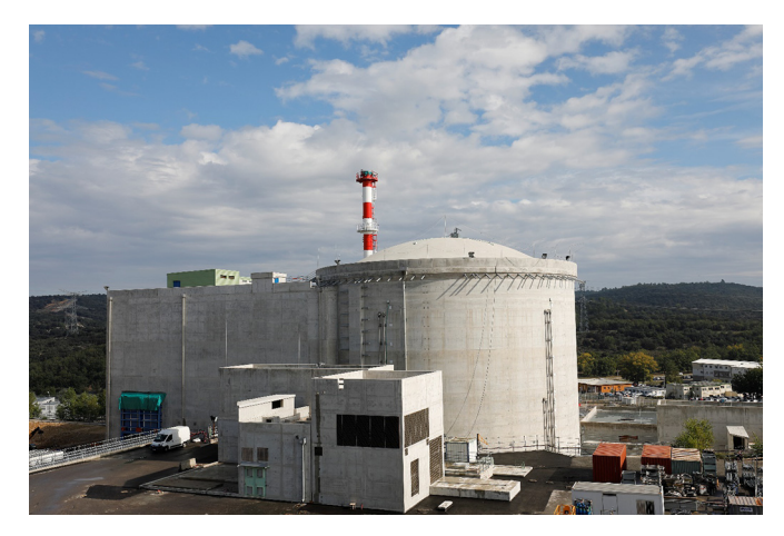
Fig. 1. Jules Horowitz Reactor – October 2017.

The construction is made within the framework of an international consortium: CEA, EdF, AREVA SA, Framatome, Technicatome (France); European Commission with JRC as Observers; CIEMAT (Spain); SCK-CEN (Belgium); VTT (Finland); UJV (Czech Republic); Studsvik AB (Sweden); NNL (UK); DAE (India); IAEC (Israel). Some contacts are ongoing with other foreign entities to discuss their potential interest to join the consortium, or to participate in future programmes.