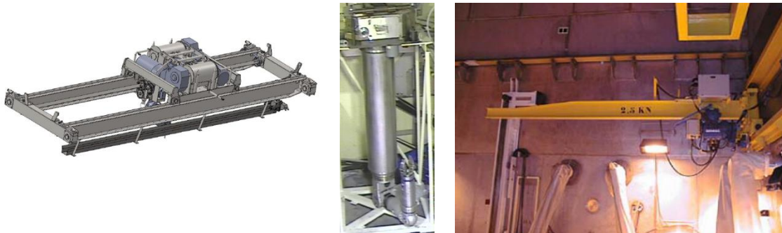
Figure 4. Overhead crane (3D model) - Power telemanipulator - Single girder wall travelling crane

All final as-built drawings of 1983 were used to fabricate the elements and to model the equipment in three dimensions.