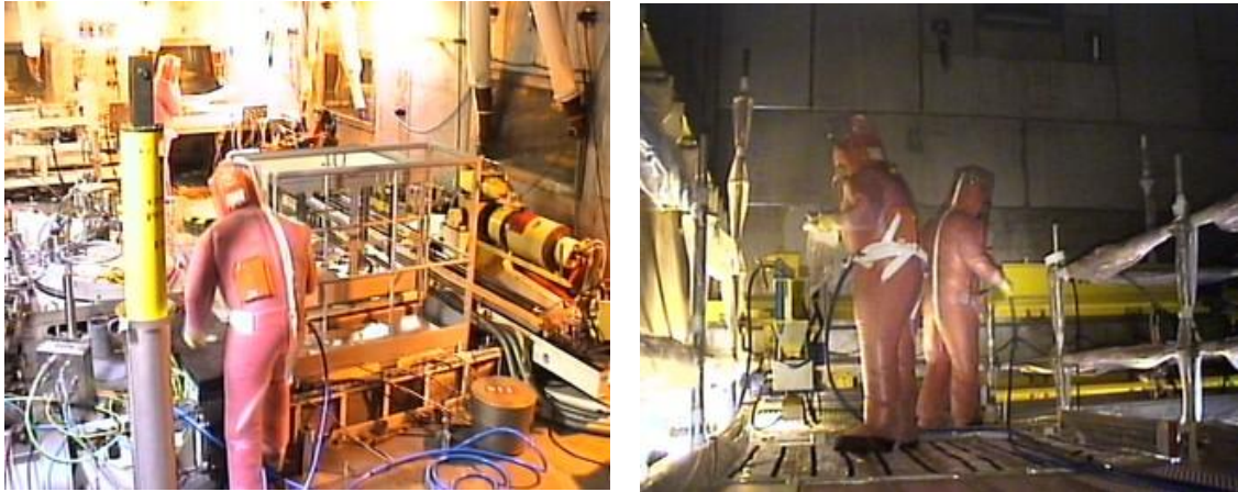
Figure 3. Cleaning-up floor and + 5m

The global radiation dosimetry of this operation was approximately 3,4 mSv for 108 interventions of 2 hours each.