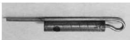
Fig. 3. View of the dip sampler (92 mm length, 12 mm outside diameter).

The objective is to be able to take a sample of liquid LBE in any facility through an air lock to perform subsequent chemical analysis with the following required specifications for the sampling system: sample homogeneous and fluid liquid metal; a system that does not pollute liquid metal sample; a system which is easy to operate, as it is required to operate in a nuclear environment; a system that may be quickly cooled. Such device has already been developed for the lead-lithium related technologies. The basic principle was to adapt the sampling system to the LBE melt and achieve a first qualification on a static facility in saturated conditions. A view of this dip sampler developed for the lead-lithium alloys is provided in Fig. 3. The tube on the bottom part, opposite to the hole for the inlet of the melt, was necessary to ensure a good filling of the sampler by enabling out gassing. This tube is no more needed for lead-bismuth alloy, because of its density. The dip sampler fabrication is thus simplified. The nature of the alloy used is stainless steel. The stripy marks done during fabrication on the external surface of the dip sampler enable a very easy discarding of the steel, like the