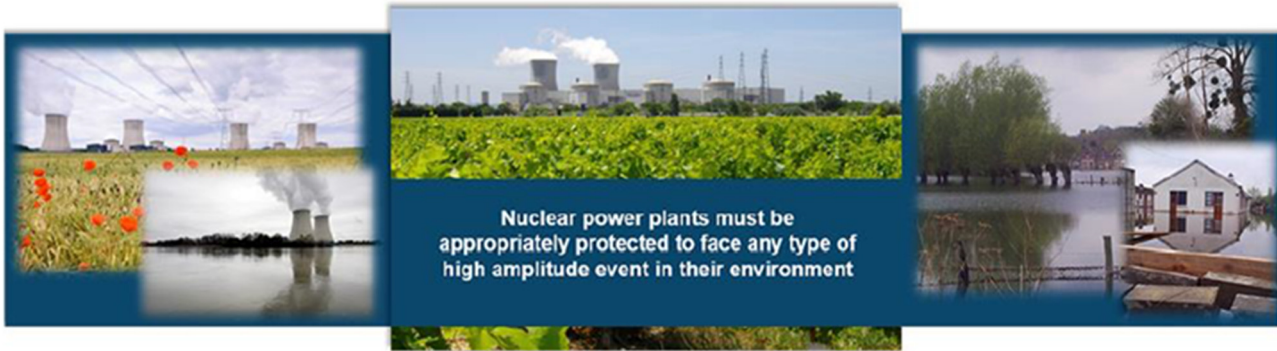
Fig. 1. The FP-7 ASAMPSA_E project.

hazard-induced damage states representing the variety of their initial conditions in terms of relevant parameters and availability of relevant systems, functions and equipment. For the existing plants, the focus will be mainly put on Beyond Design Basis (BDB) sequences.