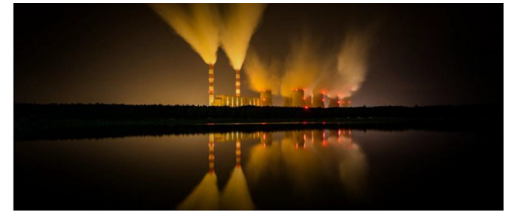
Fig. 2. The NARSIS project.