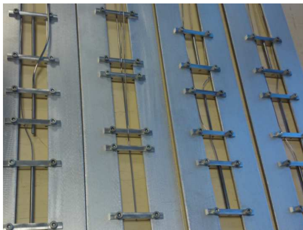
Figure 2. Photograph of the aluminium VASCO SPD holders with SPDs mounted in threes.

In addition to self-powered detector irradiation tests, neutron flux levels (thermal and fast) in the experimental locations have been experimentally determined using activation detectors. Gamma flux levels were also evaluated using a CEA recently developed process for miniature ionization chamber (MIC) signal analysis [3].