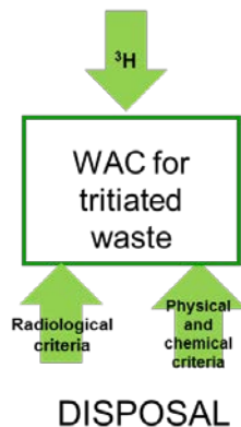
Fig.2: Approach to define WAC for tritiated waste interim storage

The results of implementing this approach are detailed in the next sections.