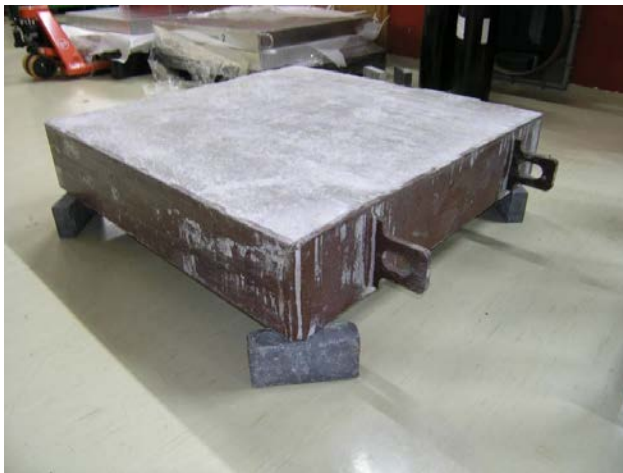
Figure 1. Concrete shield block.

The concrete shielding blocks were provided by CEA Saclay along with the collimators and collimator stands used during the experiments. Some of the shielding blocks were configured to create the scattering box used during the experiments, whose stand was provided by CEA Valduc. Pictures of these can be seen in Figures 1–3 in reference 1. CEA Saclay provided shield blocks of four different types of concrete: standard, magnetite, barite, and colemanite. During these experiments, none of the colemanite shield blocks were used. Figure 1 in this paper is a photograph of one of the shield blocks, and Figure 2 shows a computational model of one shield block.