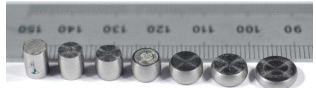
Fig. 1. Samples of HE 14Cr-ODS material cold deformed to different conditions.

In a second stage, HE samples have been cold deformed to different deformation conditions (Fig. 1) and heat treated at temperatures ranging from 850 to 1450°C during 30 min.