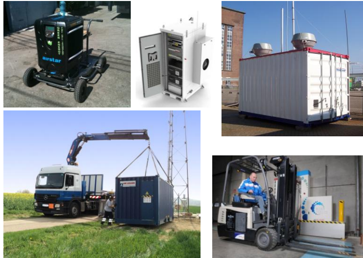
Figure 1. Examples of hydrogen energy applications.

It may also be necessary or desirable to locate some hydrogen system components/equipment in indoor or outdoor enclosures for security or safety reasons to isolate them from the end-user and the public, or from weather conditions. Use of hydrogen in confined environment requires detailed assessment of hazards and associated risks, including potential risk prevention and mitigation features.