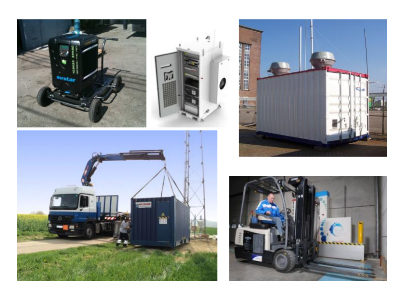
Figure 1. Examples of hydrogen energy applications.

It may also be necessary or desirable to locate some hydrogen system components/equipment in indoor or outdoor enclosures for security or safety reasons to isolate them from the end-user and the public, or from weather conditions. Use of hydrogen in confined environment requires detailed assessment of hazards and associated risks, including potential risk prevention and mitigation features.