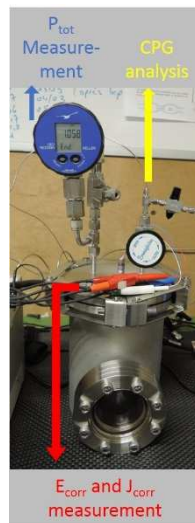
Figure 3: Electrochemical-gas measurement coupled reactor