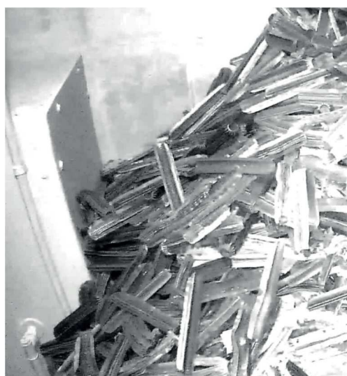
Figure 1: Pieces of Magnesium cladding stored in CEA Marcoule

The reprocessing of spent fuels from UNGG (Uranium Natural Graphite Gas) nuclear reactors in France has generated cladding wastes mainly made of Mg alloys [1] (Figure 1). The waste will be conditioned in a waste-package, ensuring durability, handling capability, and confinement of the radionuclides during further storage period and final disposal [2]. The embedding and conditioning of magnesium waste are based on their immobilization in a hydraulic binder (Figure 2). Several binders were tested: OPC, cement with blast furnace slag, cement with fly ash, geopolymer, etc. In any case, they imply that the waste will be exposed to a very basic environment ( \text{pH} > 12 ). Corrosion of magnesium could have consequences on the structural integrity of a cemented long-term package, due to the expansive corrosion products that form and cause stress within the coating matrix. In addition, corrosion leads to \text{H}_2 production, which has to be taken into account to ensure the safety of the storage of conditioned waste packages.