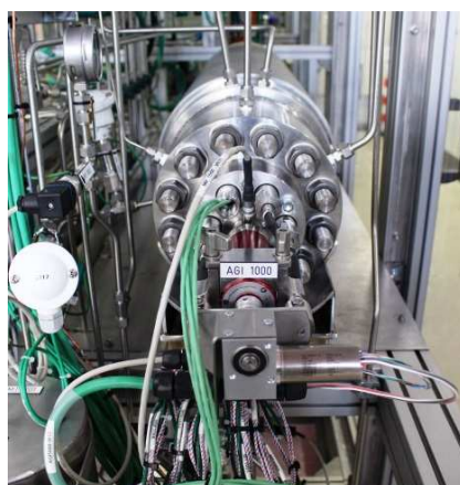
Figure 2: Second generation of continuous stirred shell reactor (V= 2L)

At the outlet of the reactor, the fluid is expanded through a pressure regulator before reaching a gas/liquid separator in which the aqueous and gas phase are separated. The gas phase is analyzed online ( O_2 , CO_2 ) to control directly the efficiency of the process.