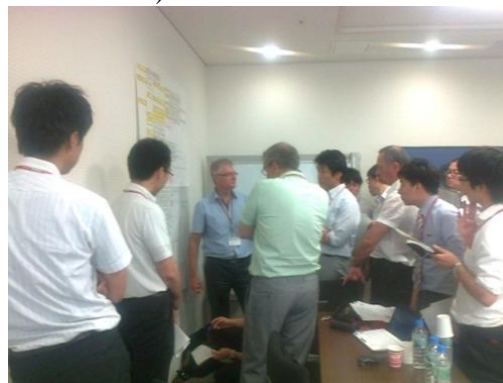
Fig. 2: Preparatory meeting of the design activity at Tokyo, June 2014

In 2013, Japan and France initiated the discussion for an entry in the ASTRID project. Five working groups were created: 1/Definition of the terms of the agreement and of its principles of governance, 2/ASTRID design activity, 3/R&D on severe accidents, 4/R&D on fuel, 5/Other R&D items (Na technology, ISI&R, Instrumentation).