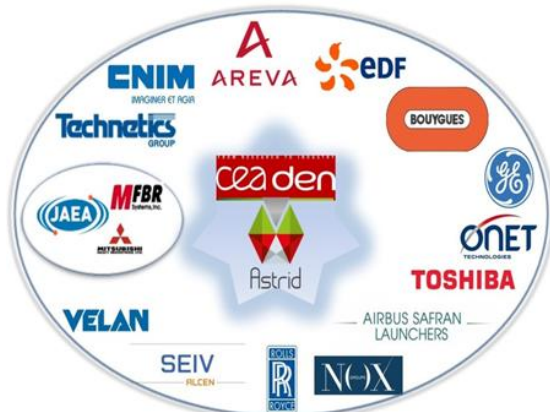
Fig. 1: Set of ASTRID Partnership

For the Basic Design phase, CEA has renewed the bilateral partnerships for this new step, reflecting the determination of the different partners to be involved in the ASTRID project. As shown in Fig. 1, it was settled of 14 bi-lateral partnerships connected to CEA at the beginning of the Basic Design phase.