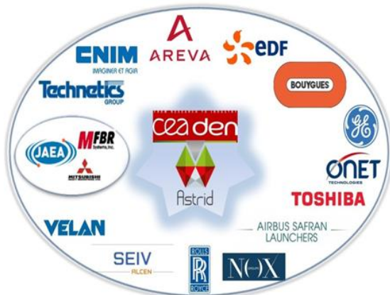
Fig. 1: Set of ASTRID Partnership

For the Basic Design phase, CEA has renewed the bilateral partnerships for this new step, reflecting the determination of the different partners to be involved in the ASTRID project. As shown in Fig. 1, it was settled of 14 bi-lateral partnerships connected to CEA at the beginning of the Basic Design phase.