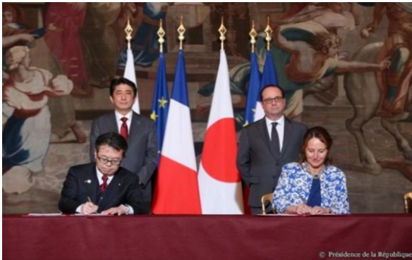
Fig. 4: Picture of Ms Ségolène Royal and Mr Hiroshige Sekō signing the 21 st of March 2017 the New Fr-Jp collaboration agreement on Nuclear Energy

Both partners will make all possible efforts to achieve their discussion at the end of 2018, or sooner if possible, in order to settle the new phase of their collaboration.”