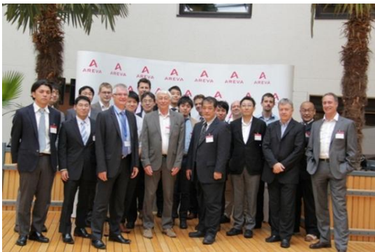
Fig. 3: First face to face meeting at Lyon, September 2014

The "implementing arrangement", signed by JAEA, MHI, its subsidiary Mitsubishi FBR Systems (MFBR), AREVA (now Framatome) and CEA. It specifies in detail the principles and the governance of the R&D and design activities, the intellectual property and rights of use, the transfer of information to third parties, the rights after 2019 etc. At the starting point, 29 Task Sheets were approved, three for ASTRID design and 26 for R&D.