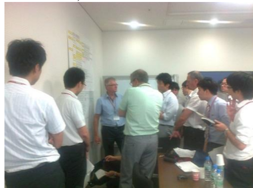
Fig. 2: Preparatory meeting of the design activity at Tokyo, June 2014

In 2013, Japan and France initiated the discussion for an entry in the ASTRID project. Five working groups were created: 1/Definition of the terms of the agreement and of its principles of governance, 2/ASTRID design activity, 3/R&D on severe accidents, 4/R&D on fuel, 5/Other R&D items (Na technology, ISI&R, Instrumentation).