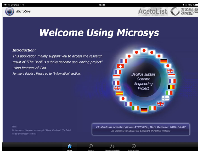
Fig. 1. Based on SubtiList, a draft interface for microbial databases built up for tablets at the BGI.