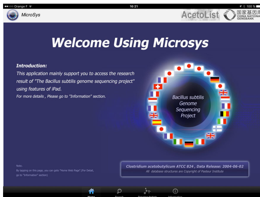
Fig. 1. Based on SubtiList, a draft interface for microbial databases built up for tablets at the BGI.