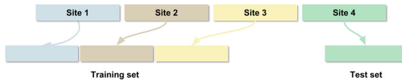
Fig. 1. Leave-one-site-out procedure. [Colour figure can be viewed at wileyonlinelibrary.com ]

was evaluated on the weight maps provided by both sparse classifiers: Enet and Enet-TV. Indeed, SVM yields dense weight map and thus comparing the region selected across fold is not relevant.