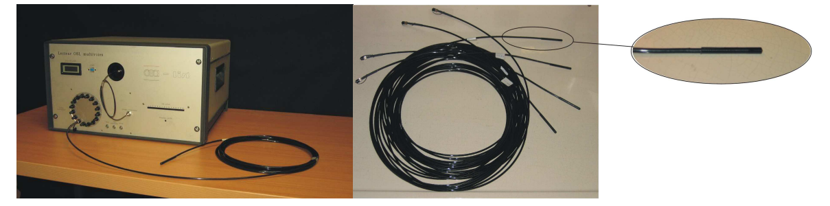
Fig. 1.: View of the OSL dosimeter of the CEA LIST and fibre sensors

Firstly, a self-test function checks every critical device to make sure that the instrumentation is operational before treatment. Secondly, since the dose value is proportional to the OSL signal, any abnormal change in fibre transmission (for instance, due to a misconnection) will lead to an underestimation of the dose. This is, of course, unacceptable in a medical context. Therefore, fibre transmissions (ratios return power / laser power) are monitored in real-time with two photodiodes incorporated in the system and an alarm is triggered whenever they exceed a pre-determined threshold. Finally, eye safety linked to the use of a class IIIb laser is also taken into account. Any drop in transmission (due to disconnection or fibre breakage) is detected early in order to shut down the laser beam and avoid a hypothetical accident.