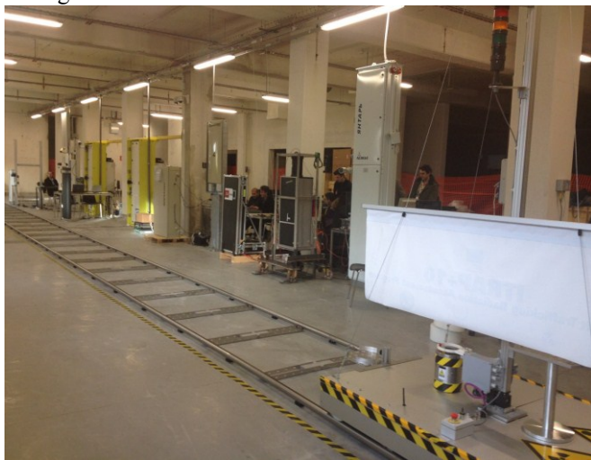
Fig. 2. ITRAP facility

The first SCINTILLA benchmark has been performed at the JRC premises in Ispra using the existing ITRAP facility for dynamic tests here described. This facility has been designed to host irradiation tests with moving sources in order to reproduce transit situations at fixed portals or search with moving detectors.