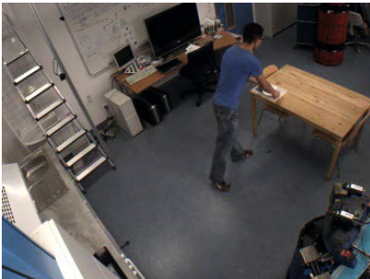
example of action: Lowering an object

TUM is a multi-sensor dataset and in particular it contains skeleton streams (fig. 1). It is composed of 19 sequences about 2 minutes each, containing 9 kinds of actions like Lowering an object , Opening a drawer , performed by 5 subjects. To provide results comparable to [20], the dataset is separated in training and testing sequences, all algorithms decide an action for each frame of each testing sequence and the performance is measured by the ratio of correctly decided actions.