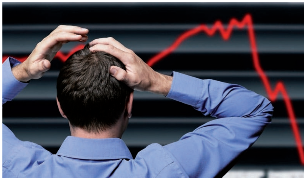
Collective psychology might be mirrored in the social information contained in financial market indices.